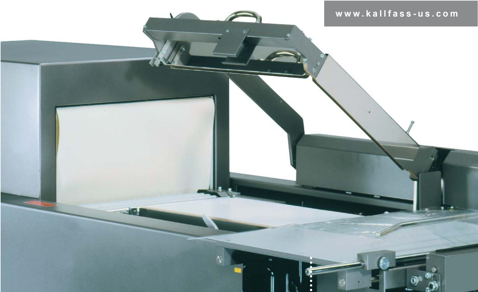
Compact L-sealer with shrink tunnel