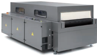
The figure may show optional equipment, ordered separately

The unique ring nozzle heating system with a quadruple-construction design makes it possible to package large products with minimum energy use. The highly effective heat insulation and extremely accurate temperature control ensure perfect packaging results. The tunnel was designed for the upper performance range.