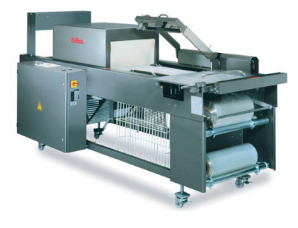
The figure may show optional equipment, ordered separately

The compact L-sealer KC 5040/450 in combination with high performance shrink tunnel. The qualities of this series of machines become evident when subjected to hard, continuous use. Products such as for example printed material, sets of glassware or oil containers can all be packed quickly and economically whilst maintaining a high quality.