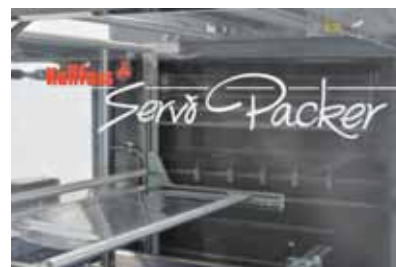
The Servo Packer 500 T with the intermittent operating principle in customary Kallfass quality