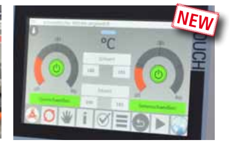
Universa 500 Servo: Perfect packaging results for highest requirements. With 7" widescreen Easy Touch-Panel.